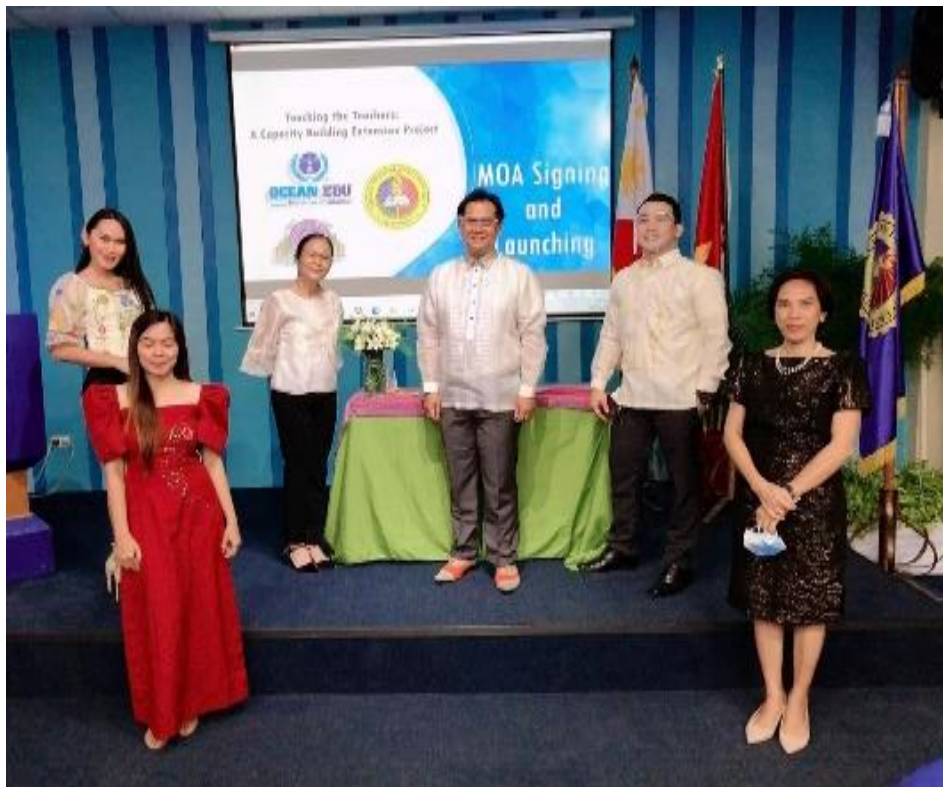
Figure 2. The English and Literature Department recently launched an extension program with OCEAN EDU of Vietnam.