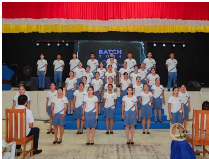
Figure 4. The Pinning Ceremony BS Psychology senior students.