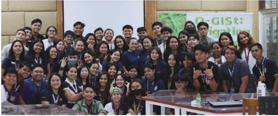
Figure 8. NORSU Geology students host mapping software workshop.