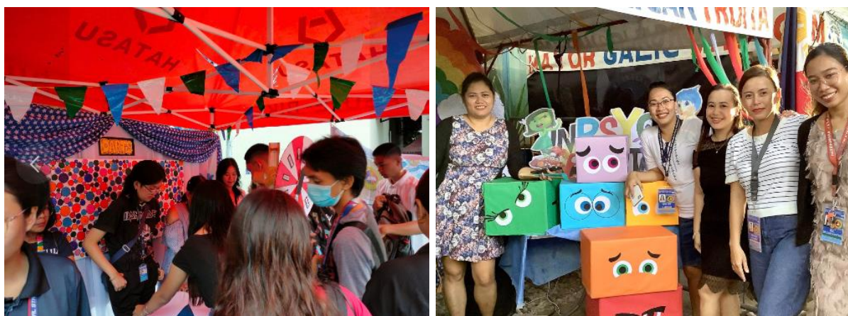
Figure 5. BS Psychology students posing in their booth during the CASadya Day Celebration.