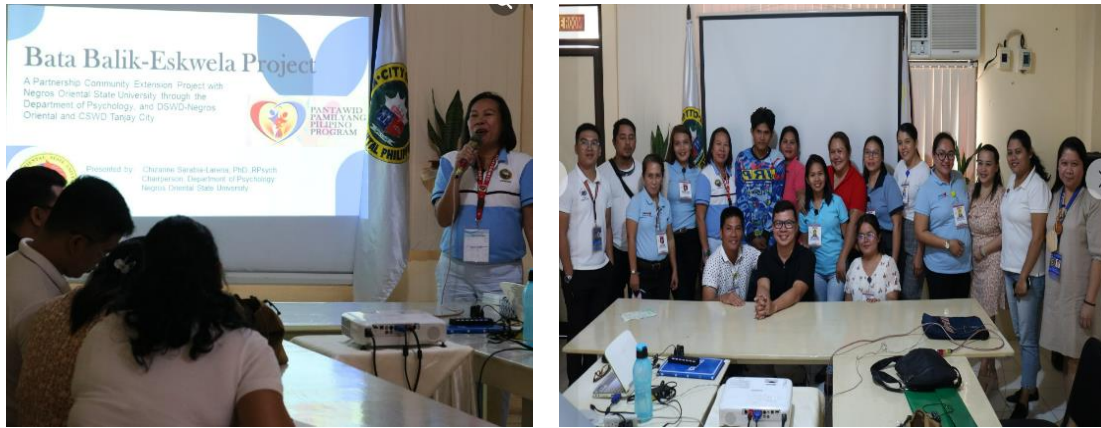
Figure 3. The Psychology Department conducted the ‘Bata Balik-eskwela Project’ with the Division of Tanjay City.